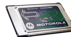
CableCARD devices (TiVo)